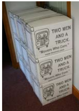
Boxes are ready to be shipped.

December: Infant's clothing and bedding supplies