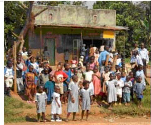
Top: Orphan children are in front of their two-room school house and worship center. On Sundays, a plastic canvas awning is extended from the building to hold worship services rain or shine for more than 150 people. This orphanage has 250 children during the school year.